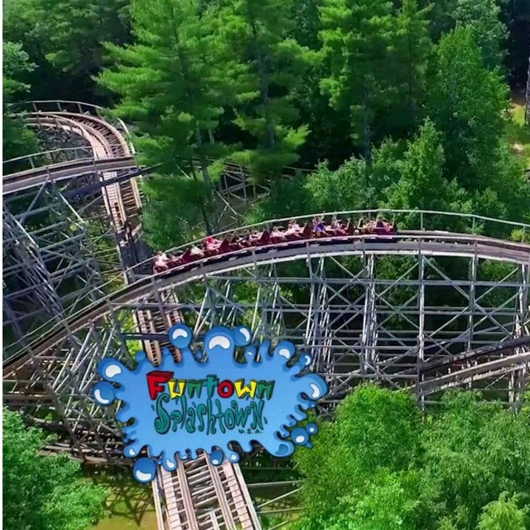
Food and Beverage at an Amusement and Water Park in Saco, Maine.